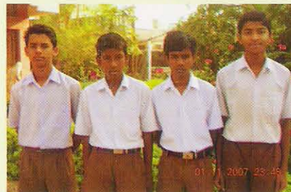
Attending Regional Mathematics Olympiad Camp -2006.

38 students were selected from all over Orissa in the Senior RMO Contest. Students from Class IX to +2 appeared at this test from English as well as Oriya medium schools and colleges. Out of these 38 students 4 are from Rtapalli (3 from Class IX) with ranks: 3 rd , 9 th and 18 th , where as BJB College has 4 students out of whom one is an alumnus of Rtapalli.